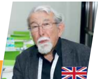
Prof. Sir Tom Blundell Director of Research, University of Cambridge, UK